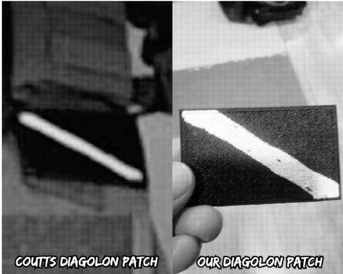
Image 7: Image posted to Jeremy MacKenzie’s podcast comparing the “official” Diagonon patch to the patch found in Coutts